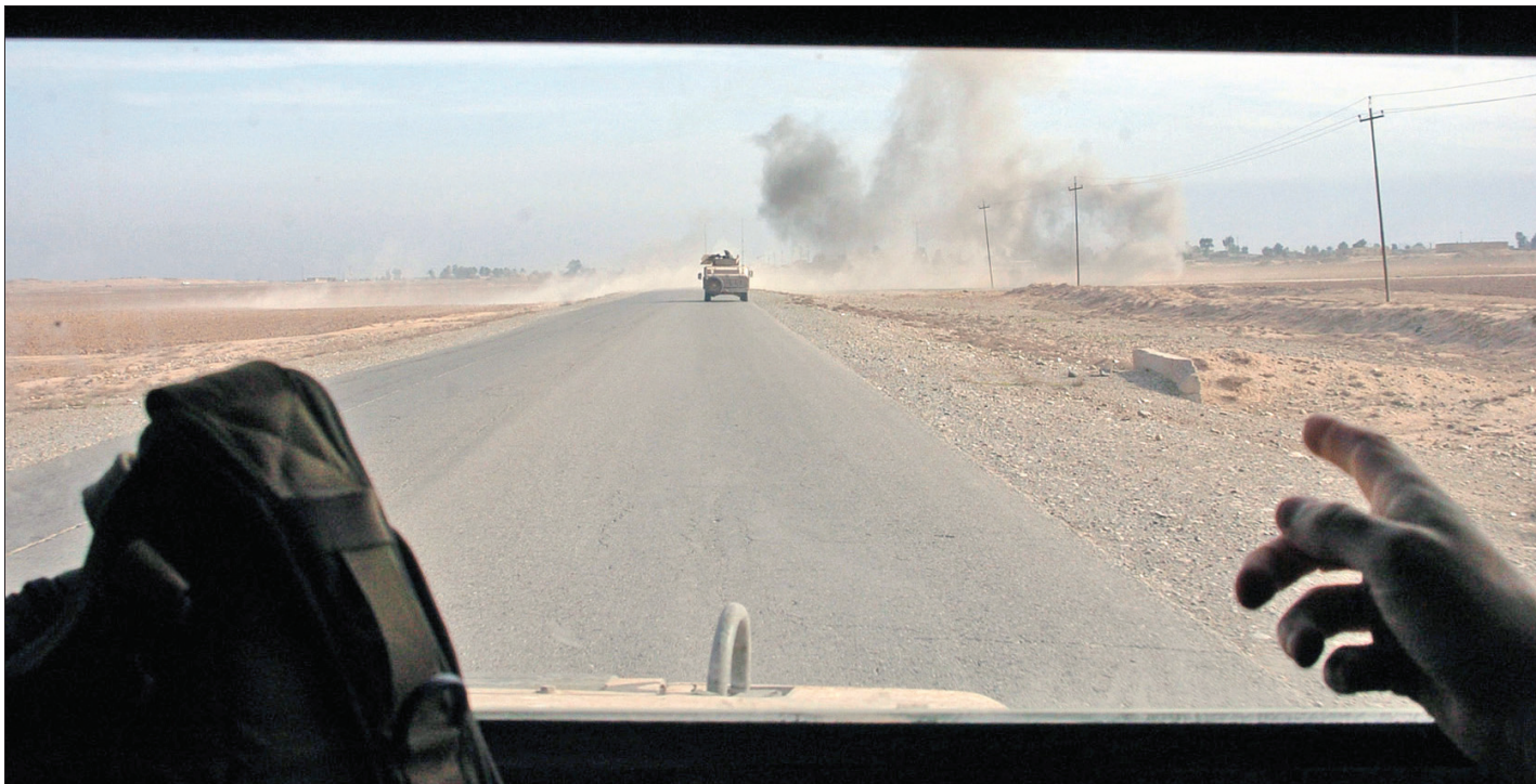
Smoke and dust rises after an IED explodes in front of a TF 1-27 Inf. convoy. The IED detonated onto the convoy after soldiers were heading back to FOB McHenry following humanitarian missions. No one was injured in the explosion. (Sgt. Sean Kimmons)

Treated with hyperbaric oxygen, the adverse consequences of these bubbles are avoided and the long-term effects of the injuries caused by them are prevented. Untreated, the injury caused by these bubbles may leave the individual with a lifelong disability, whose presentation is dictated by the final resting place of the bubbles.